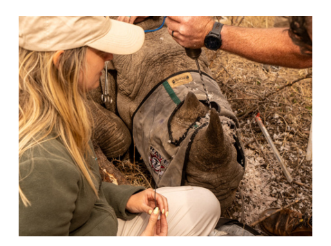
SOUTH AFRICA 16 - 22 AUGUST 2025