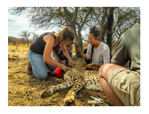
SOUTH AFRICA 1 - 7 JUNE 2025