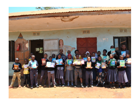
TANZANIA 25 JULY - 3 AUGUST 2025

Education and wildlife discovery mission