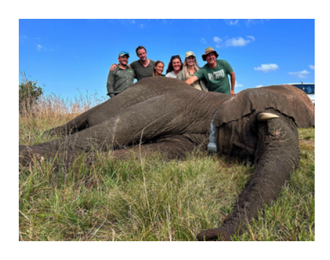
SOUTH AFRICA 10 - 16 AUGUST 2025 (FAMILY TRIP)